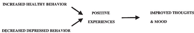
Figure 1. A diagram outlining the treatment rationale.

Regarding depressed behavior, possible benefits include the avoidance of certain unpleasant or stressful activities, other people completing your responsibilities, or receiving more attention and sympathy from your family and friends. Because of these immediate benefits, it is not surprising that depressed behaviors may become more frequent, especially if the benefits of healthy behavior appear to be more difficult to achieve and less immediate. Unfortunately, as the frequency of depressed behaviors increase and the frequency of healthy behaviors decrease, important life areas may become neglected (work absences or decreased social contact), and long-term negative consequences often result. Again not surprisingly, these consequences produce a “downward spiral” that may make you feel both overwhelmed and trapped in your depression.